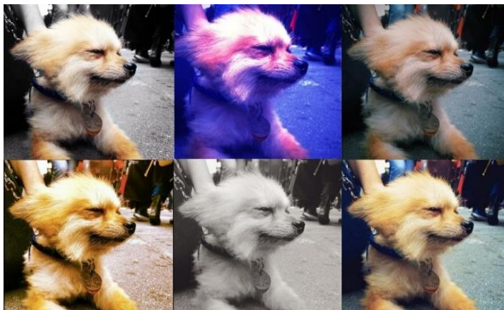
Figure 4. An example of the effect of applying five Instagram filters to the same image (Kohn, 2016: 201)